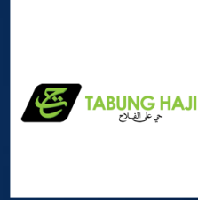
Lembaga Tabung Haji