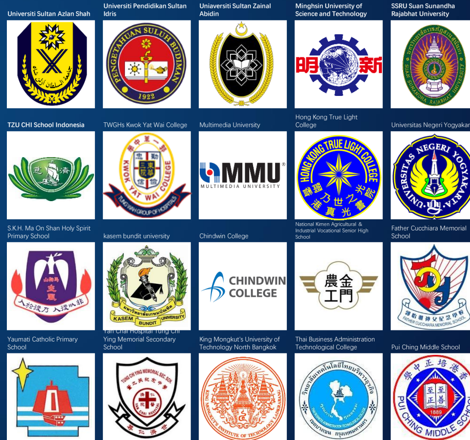
Edugate Learning System Multimedia University