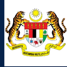
Ministry Of Human Resources