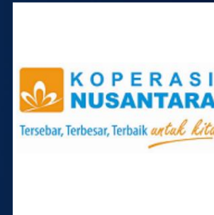
PT Koperasi Nusantara