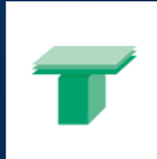
TSI Holdings Sdn Bhd