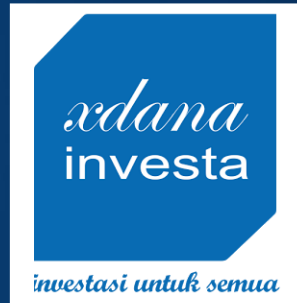
PT Xdana Investa Indonesia