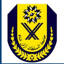
Universiti Sultan Azlan Shah