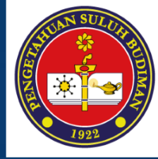
Universiti Pendidikan Sultan Idris