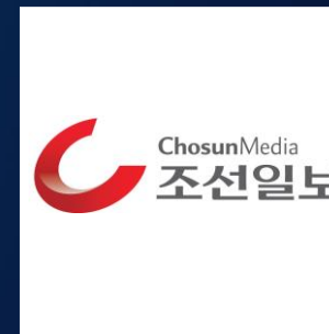
Digital Chosun, Inc.