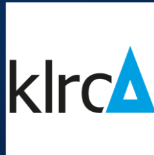
Kuala Lumpur Regional Centre for Arbitration