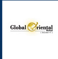
Global Oriental Berhad